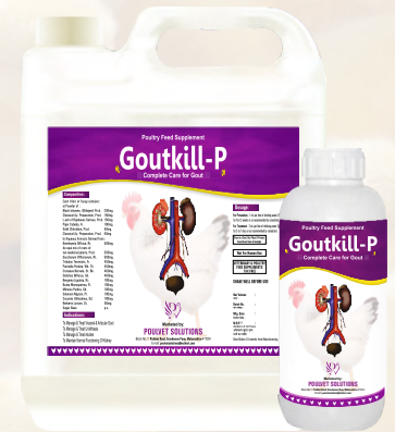
Pack: 1 Ltr. & 5 Ltr.

For Treatment - 2 ml. per liter of drinking water 24 hrs. for 5 to 7 days or as recommended by consultant.