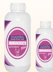
Pack: 500 ml. & 1 Ltr.