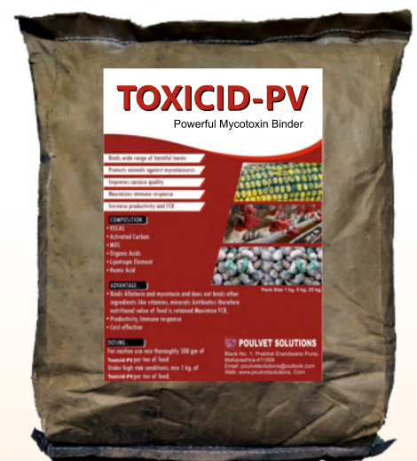
Pack: 25 Kg.

Under high risk conditions, mix 1 kg. of Toxicid-PV per ton of feed.