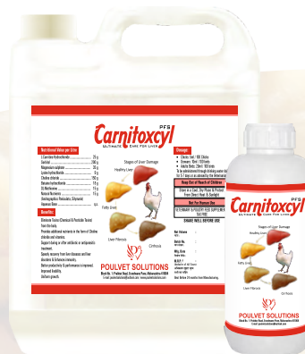
Pack: 1 Ltr. & 5 Ltr.

To be administered through drinking water daily for 5-7 days or as advised by the Veterinarian