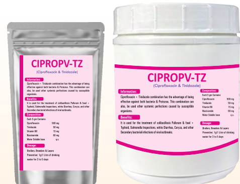
Pack: 100 & 500 gm.

Preventive: 1g/1 Litre of drinking water for 3 to 5 days