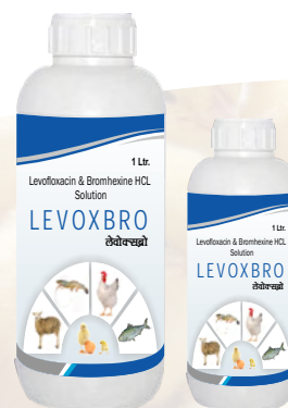
Pack: 500 ml. & 1 Ltr.