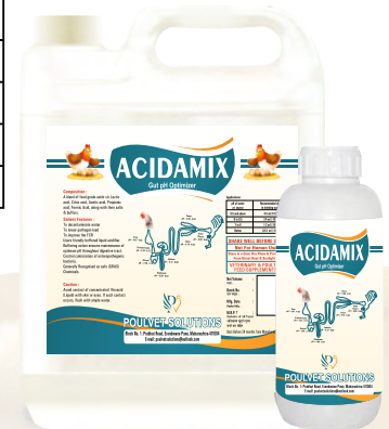
Pack: 1 Ltr. & 5 Ltr.