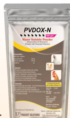
Pack: 100 gm.