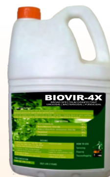
Pack: 500 ml, 1ltr, 5 ltr