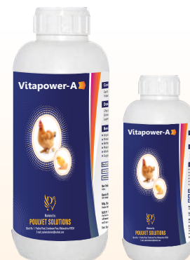
Pack: 500 ml. & 1 Ltr.

Recommended during chick rearing to prevent infections and for better growth