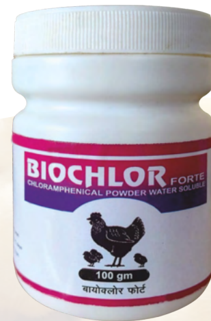
Pack: 100 gm.

1gm-2gm in 2 Ltr of Drinking Water for 5 to 7 days. or as directed by Veterinarian.