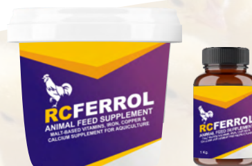
Pack: 1.25 Kg. & 5 Kg.

Chicks: 30 gm. per 1000 birds daily. Layers: 20 gm. per 100 birds daily. Broilers: 20 gm. per 100 birds daily. Breeders: 40 gm. per 100 birds daily.