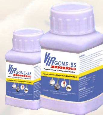
Pack: 100 & 500 gm.